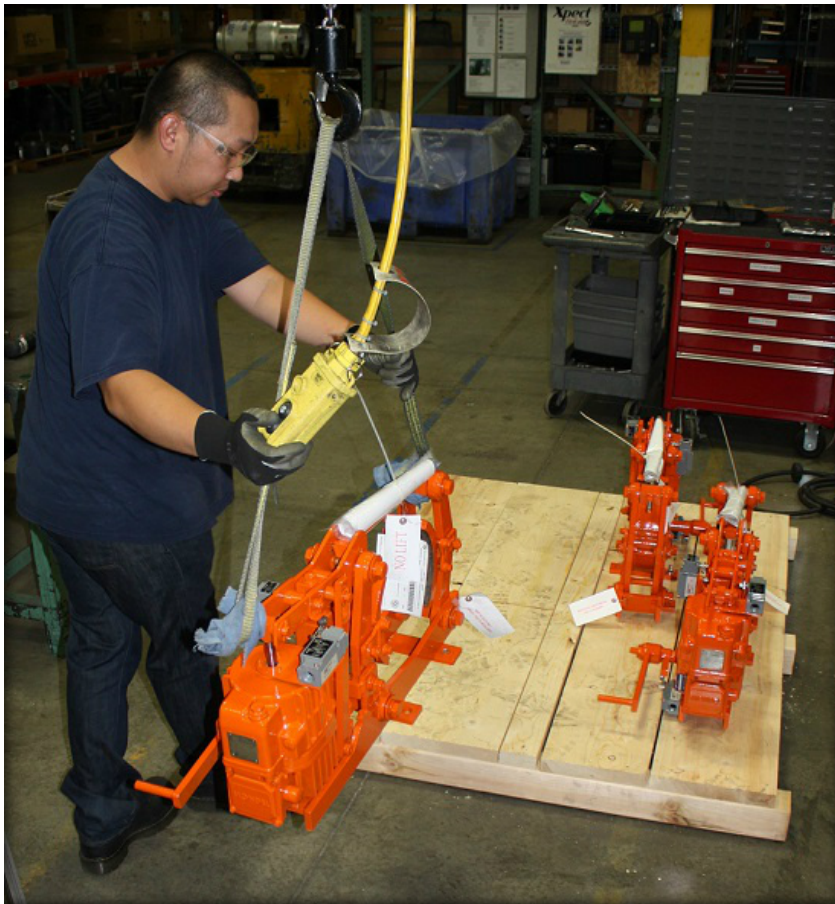
A Magnetek employee prepares a refurbished 300M Mill Duty AC Thruster Shoe Brake for shipping back to New York City.