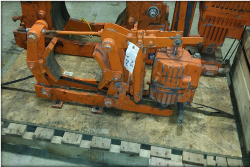
The corrosion caused by Hurricane Sandy was evident on the brakes nearly five years after the brakes were submerged in saltwater