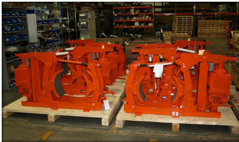
Refurbished 300M Mill Duty AC Thruster Shoe Brakes waiting for shipment back to New York City.